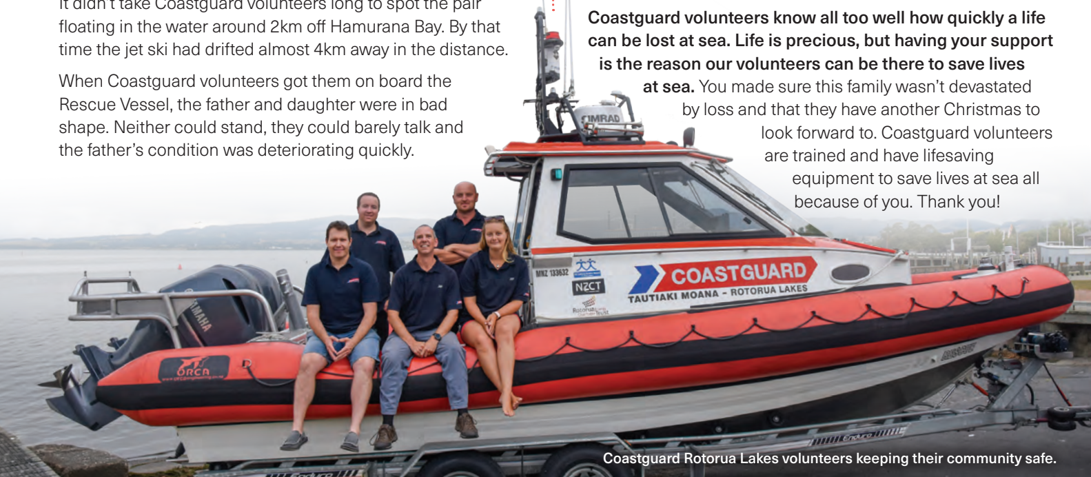
Coastguard Rotorua Lakes volunteers keeping their community safe.

Coastguard volunteers know all too well how quickly a life can be lost at sea. Life is precious, but having your support is the reason our volunteers can be there to save lives at sea. You made sure this family wasn't devastated by loss and that they have another Christmas to look forward to. Coastguard volunteers are trained and have lifesaving equipment to save lives at sea all because of you. Thank you!