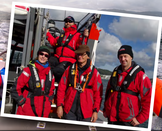
The Wellington crew saving lives at sea thanks to you!