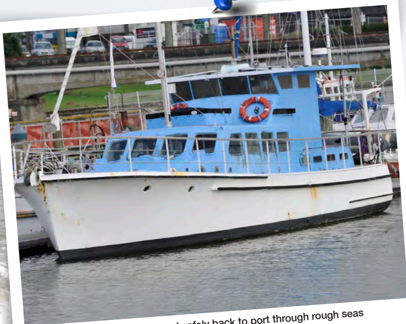
The vessel Mazurka , was towed safely back to port through rough seas by brave volunteers.