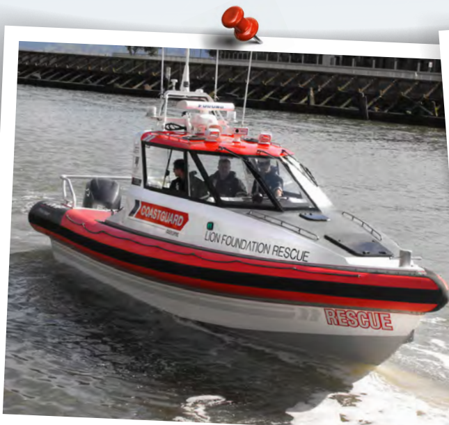
The crew aboard Lion Foundation Rescue battled big seas to rescue a Scottish couple and their beloved boat, Mazurka .

As a charity, our volunteers depend on your support to save lives at sea. It's thanks to you that thousands of people like the couple on board the Mazurka are rescued. Thank you!