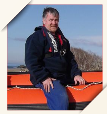
lan is just one of the many volunteers you support who goes above and beyond to save lives

"You know that if you hadn't been there then they may not have survived, and that's why we all keep coming back."