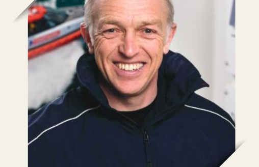
Chief Executive Officer Coastguard New Zealand

Your donations help Coastguard raise the $5,000 we need each week to train our 2,200 volunteers - ordinary New Zealanders who give their own time to save others. Thank you!