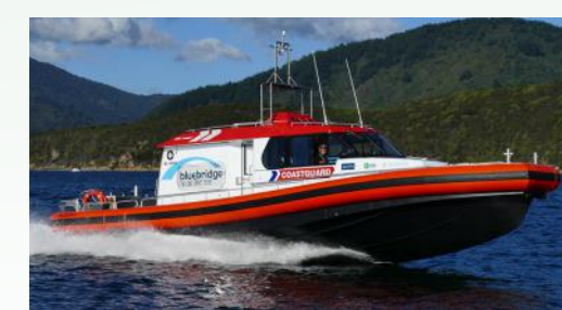
Your support for our crews has brought many people home safely

Without a medical team that were able to reach them by boat, it would've taken many hours to get help to Graeme.