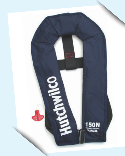
A lifejacket should be an essential part of every boatie's kit

Visit www.fundraiseonline.co.nz/TeamCoastguard to support the team.